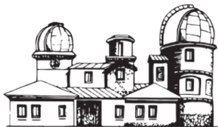
Slovenská ústredná hvezdáreň v Hurbanove